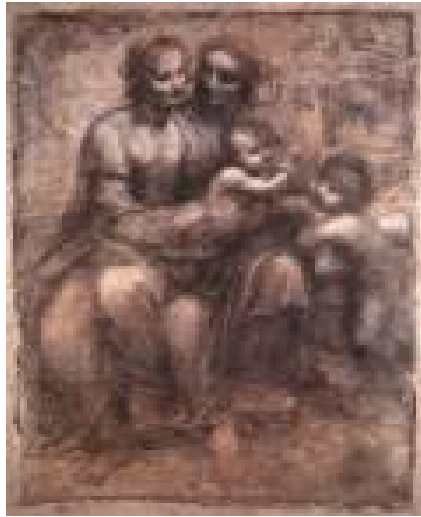
Madonna and Child with St Anne and the Young St John

The cartoon of the Madonna and Child with St Anne and the young St John is also referred to as Burlington House cartoon. In 1986, a vandal shot at the cartoon and severely damaged it around the area of Mary's chest. Restorers had an opportunity to examine the cartoon _____ repairing it. They could discover no sign on it that it was used either by Leonardo or any other artist at a later date for transferring the design to another medium. In the Pinacoteca Ambrosiana is a Holy Family attributed to Bernardino Luini. It corresponds precisely to the figural composition of the London cartoon, with the exception that Joseph is added in the background on the _____ .