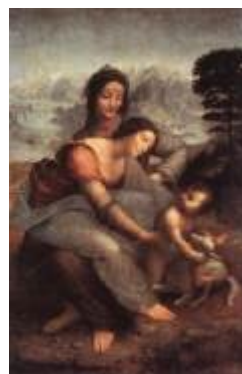
The Virgin and Child with St Anne _____