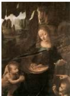
Virgin of the Rocks